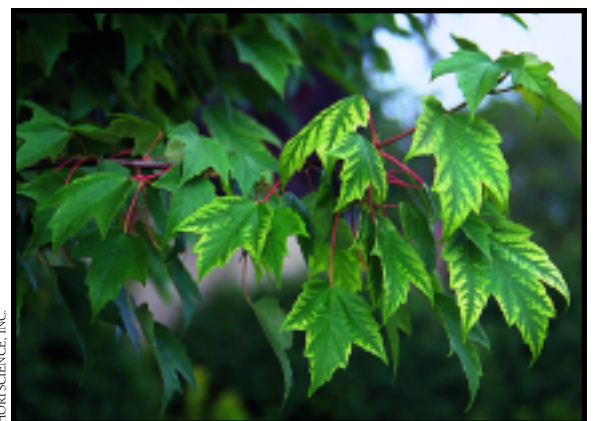
Figure 2. A common symptom of plants growing in alkaline soil is interveinal chlorosis on young foliage. This is due to unavailability of iron, zinc, or manganese at alkaline pH.

Sensitive plants growing in calcareous soil are often deficient in iron, zinc, or manganese