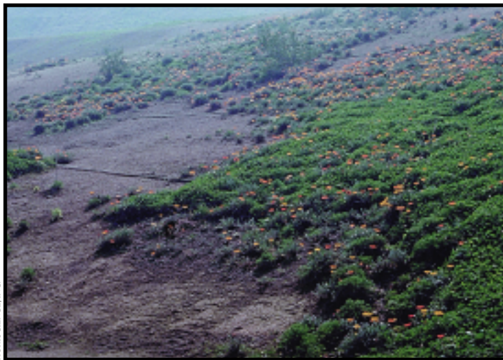
Figure 1. The pH on this cut slope ranged from 3.2, where few plants grew (left side) to 6.2, where growth was normal (right side).

Manganese toxicity produces varied patterns of leaf distortion, yellowing, and necrosis, depending on the plant species. In citrus, leaves develop marginal yellowing and tiny necrotic spots (Labanauskas 1966).